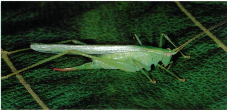
Fig. 2. Kuzicus scorpioides sp. n. ♀.