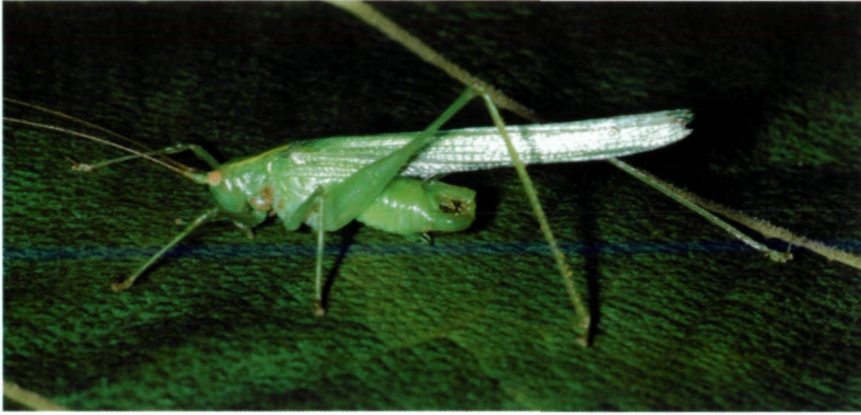
Fig. 1. Kuzicus scorpioides sp. n. ♂.