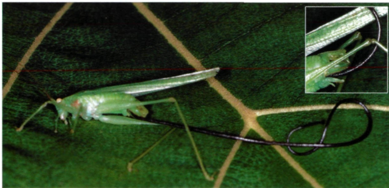
Fig. 3. Kuzicus scorpioides sp. n. ♂ and Gordian worm, leaving the host through its anus (insert).