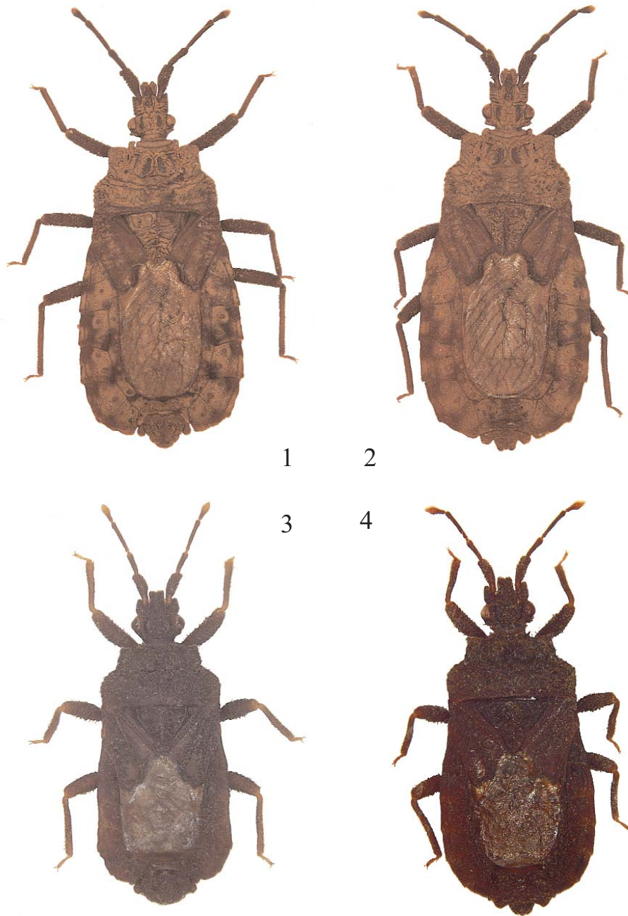
Photo 1-4. 1 – Mezira handlirschi , male (French Guyana); 2 – ditto female; 3 – Santaremia robusta , male (French Guyana); 4 – ditto female.