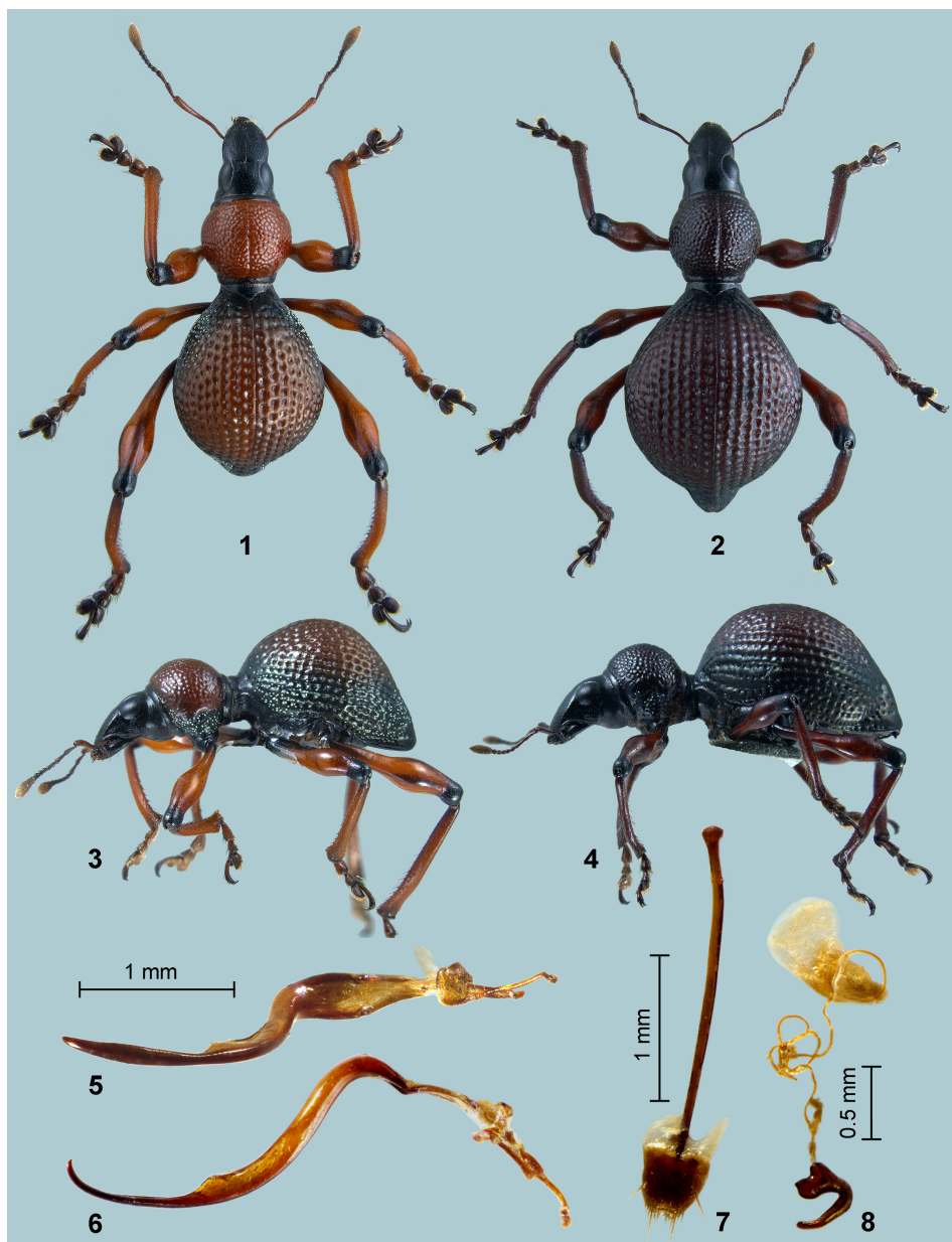
Figs. 1 - 8: (1 - 4) Habitus of (1, 3) male and (2, 4) female paratypes of Pseudapocyrthus legorskyi sp.n., in dorsal and lateral view. Note that colour is not sex-specific. (5, 6) Aedeagus of P. legorskyi sp.n., lateral view in two different aspects. (7) Sternite VIII, ventral view. (8) Spermatheca with associated ductus.