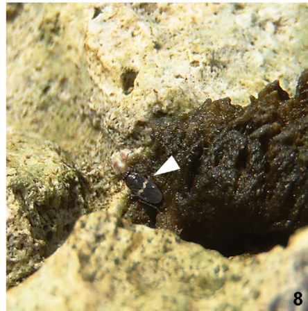
Figs. 6 - 8: (6) The type locality of Salduncula carmencitae sp.n., (7) an inhabited rock, the species' typical habitat, (8) and a camouflaged specimen.

illustrated by DRAKE (1961), somewhat resembles S. carmencitae sp.n., but it can be clearly distinguished by the absence of the basal claval spot (see POLHEMUS 1991) and it's distinctly larger size (body length 3.66 mm, according to USINGER 1946).