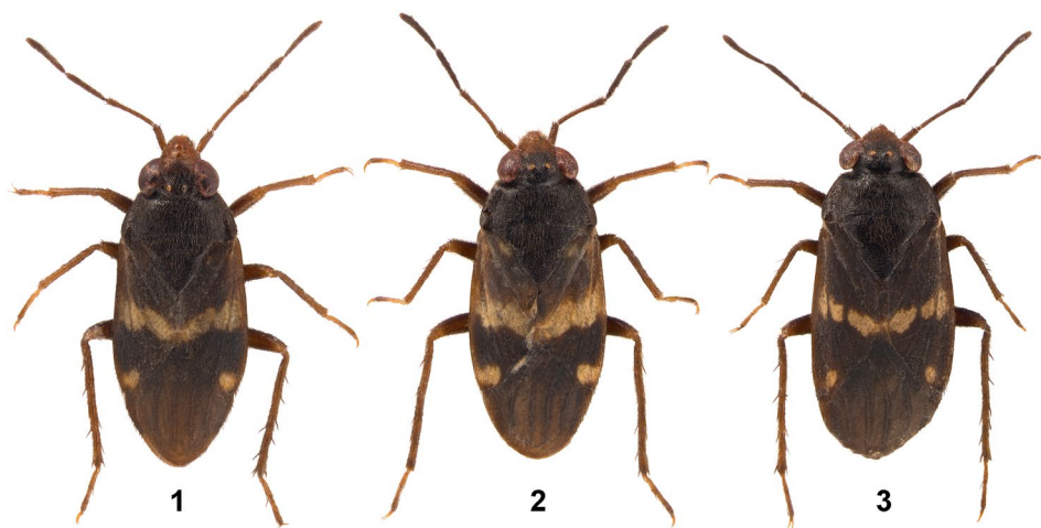
Figs. 1 - 3: Habitus of Salduncula carmencitae sp.n., males (1, 2) and female (3) with variations of colour pattern. Note that these variations are not sex-specific.

tion almost straight and at anterior and posterior corners moderately convex. Hind margin of pronotum emarginated. Mesoscutum and scutellum incompletely separated by oblique lateral impressions, both densely punctured and pubescent; their combined length 0.7 times as large as visible width of undissected mesoscutum (0.48 : 0.66). Hemelytra mat, with relatively long, scattered black setae. Membrane with four closed cells. Legs with dense, semi-erect pilosity. Mesotibia, metatibia and metatarsus bearing long, stout setae. Second tarsomere slightly longer than first on all legs. Claws with small subbasal tooth.