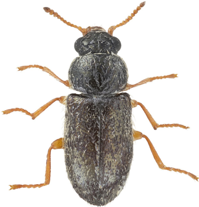
Fig. 1: Habitus of Picolistrus gemmatus sp.n., male (holotype).

sharp margins at base, becoming finer towards apex, where it is similar to that on pronotum; interspaces smooth. Female with two ordinary apical spurs on all tibiae; male with concave lamellate spurs on mesotibia (Fig. 1). All abdominal sternites and pygidium with alutaceous microsculpture in both sexes.