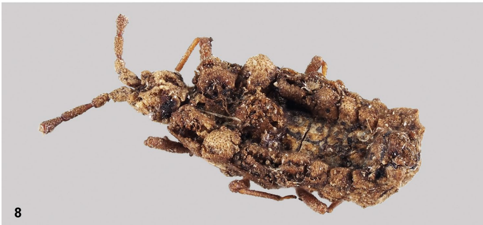
Figs 7–8. Cyclopsaptera arfak sp.n., uncleaned paratype (male), dorsal (7), lateral (8).