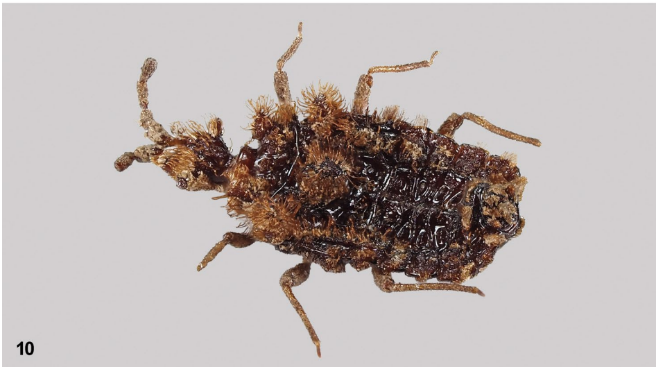
Figs 9–10. Cyclopsaptera pilosa sp.n., holotype (male), dorsal (9), lateral (10).