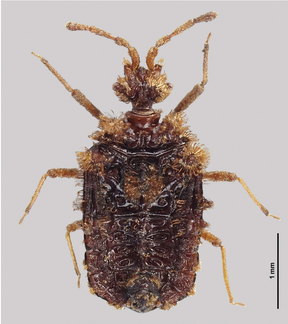
Fig. 12. Cyclopsaptera pilosa sp.n., paratype (male), dorsal.

Thorax. Densely pilose, finger-like tubercles present on lateral parts of pro- and mesonotum; scutellum distinctly bulbous and beset with setae.