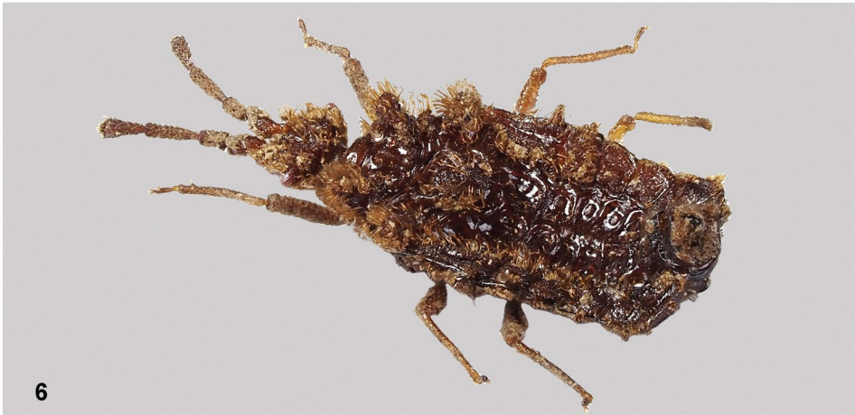
Figs 5–6. Cyclopsaptera arfak sp.n., holotype (male), dorsal (5), lateral (6).