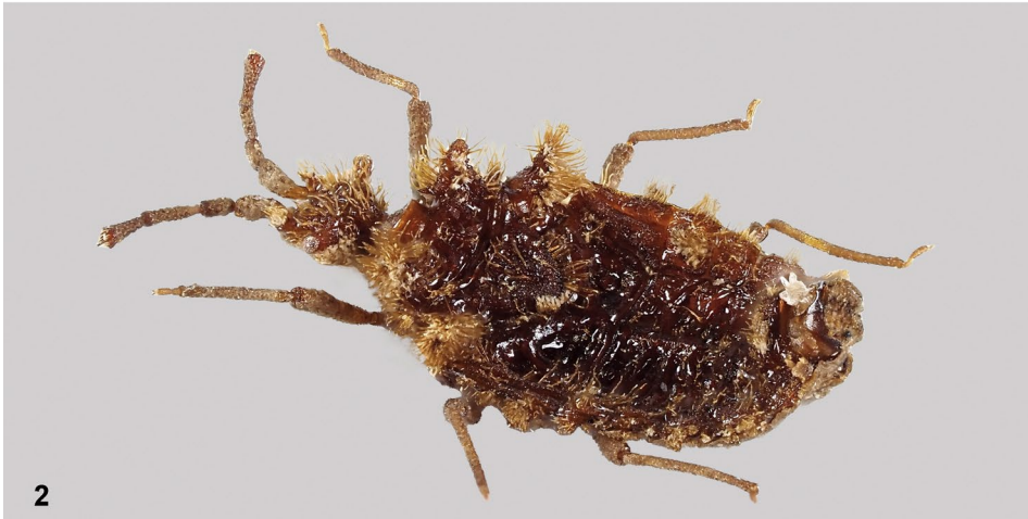
Figs 1–2. Cyclopsaptera biak sp.n. holotype (male), dorsal (1), lateral (2).