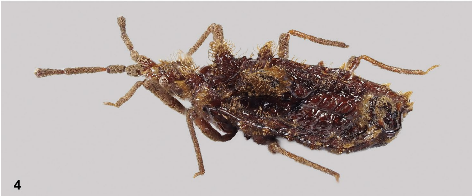
Figs3–4. Cyclopsaptera tomentosa sp.n., holotype (male), dorsal (3), lateral (4).