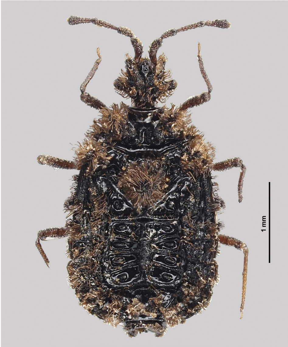
Fig. 11. Cyclopsaptera pilosa sp.n., paratype (female), dorsal.

Diagnosis. This species is recognized and distinguished from other congeners by the following combination of characters: small body length, stout habitus, and short antennae (see key).