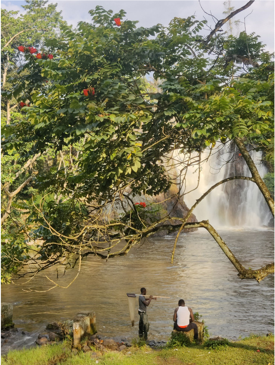
Fig. 10. Type locality at Ssezibwa River. © Wolfram Graf.