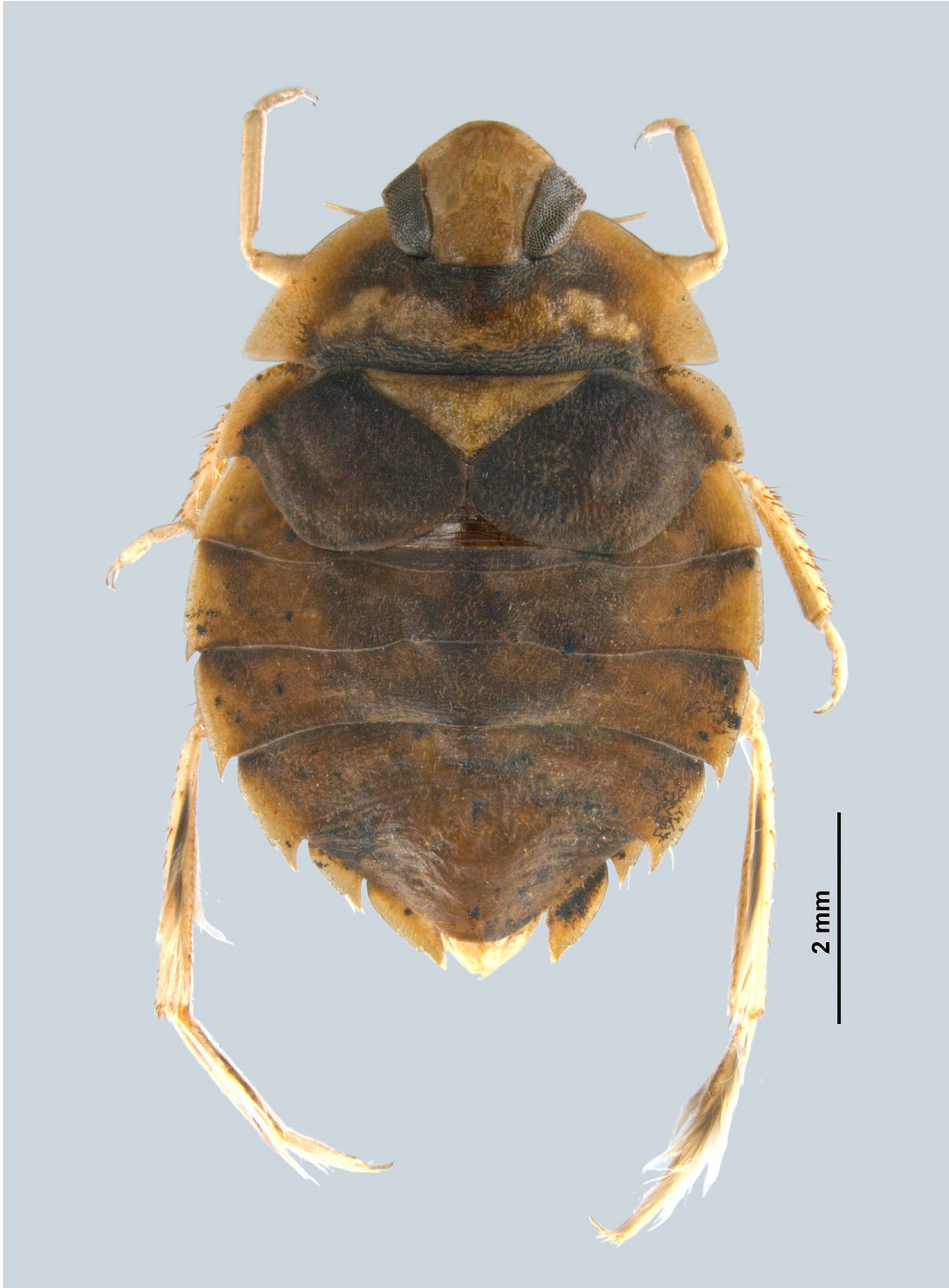
Fig. 1. Aphelocheirus winkleri sp.n., habitus of brachypterous male (holotype), dorsal view.