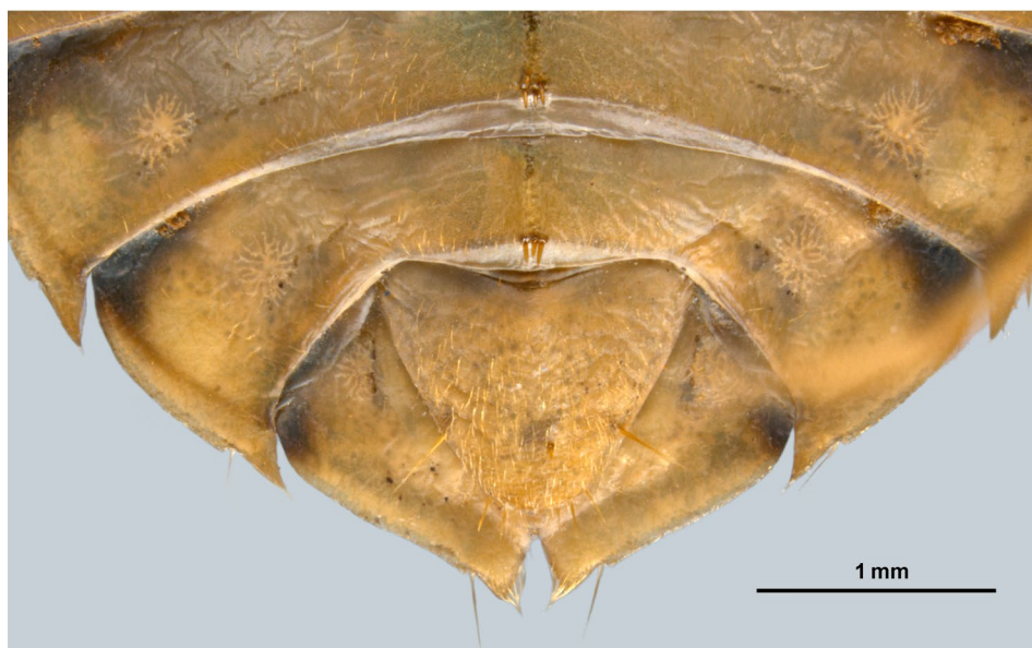
Fig. 9. Aphelocheirus winkleri sp.n., abdominal venter of female.