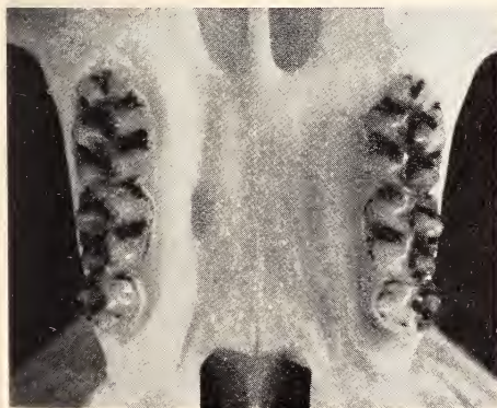
Fig. 2. Normal upper molars of P. maniculatus austerus

pattern, and roots of right and left M^1 and left M^2 and M_3 in PM 3311 be explained on this basis.