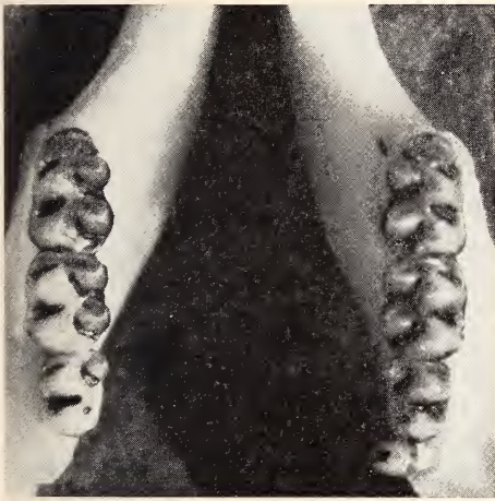
Fig. 1. The mandible of P. maniculatus austerus (WS 1313). The supernumerary tooth is in the lower right corner.

In the two skulls reported here, the fourth tooth in WS 1313 and the extra tooth on the right side in PM 3311 could conceivably represent a lost third molar, but the extra tooth on the left side in PM 3311 could not. Nor could the unusual size, molar