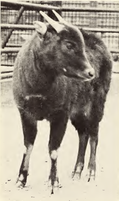
Fig. 4. Lowland Anoa cow, no 1 Surabaya D.

March 13, 1942 — bull; March 1944 — bull; March 10, 1945 — bull — died December 14, 1951; Feb. 28, 1946 — cow — sent to Pittsburgh on May 20, 1948; May 20,