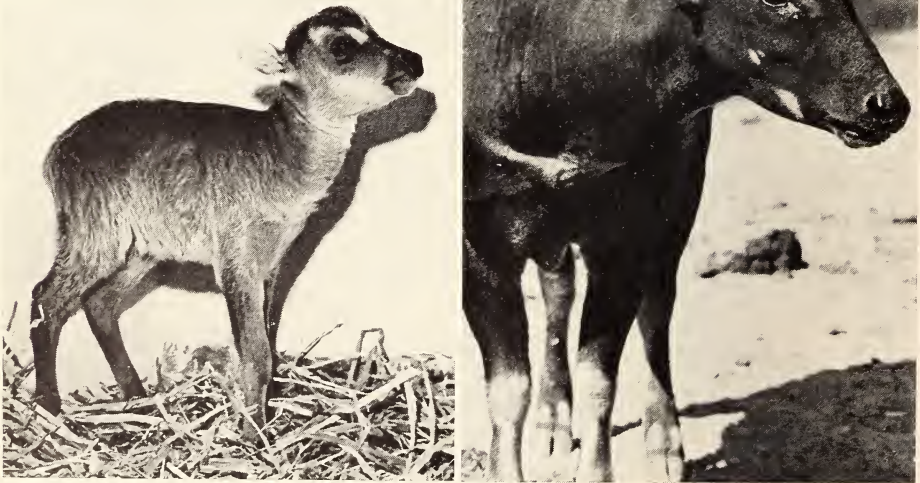
Fig. 1 (left): Lowland Anoa calf, Bubalus (Anoa) d. depressicornis , no. 16, San Diego 25 "Banda".