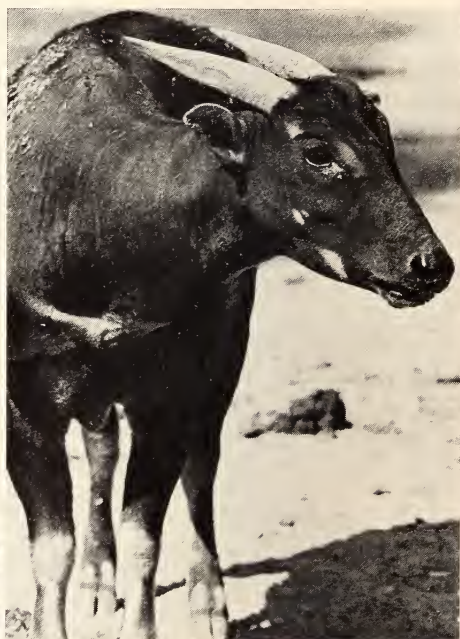
Fig. 1 (left): Lowland Anoa calf, Bubalus (Anoa) d. depressicornis , no. 16, San Diego 25 "Banda".