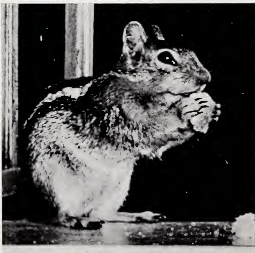
Fig. 1. Citellus lateralis chrysodeirus (Merriam, 1890)

Because of the diurnal habit and the fact that golden mantled ground squirrels (Fig. 1) have photopic retinal mechanisms, it would be reasonable to suspect that they would demonstrate color vision. ARDEN and TANSLEY (1955) by means of electroretinograms worked out the spectral sensitivity of the pure-cone retina of the grey