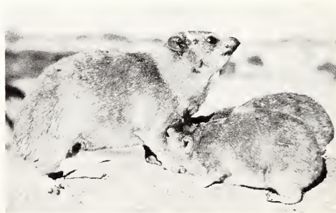
Fig. 1. two infants (about 3 months old) of P. johnstoni suckling from the pectoral teats. The fur in front of the dam's hind legs is disordered where the infants suck from the inguinal teats

Teat constancy is known in pigs (NACHTSHEIM 1925; DONALD 1937; HÖPLER 1943; BURGHARDT 1957; MCBRIDE 1963), cats (EWER 1960; ROSENBLATT 1972) and rats (BONATH 1972), all altricial mammals. Hyraxes are precocial, bearing fully developed young after a gestation period of approximately 7½ month (ROCHE 1962; MENDELSSOHN 1965; SALE 1965 a, b). The Rock hyrax P. johnstoni and the Bush hyrax H. brucei were observed in the Serengeti National Park, Tanzania, for 30 month. Most animals were marked. Hyraxes are the most characteristic resident mammals of the rock outcrops (kopjes), living in family groups consisting of an adult ♂, several adult ♀♀ and juveniles of both sexes. ♀♀ within a group have synchronized birth (1—4 young observed) and are genetically related (HOECK, in prep.).