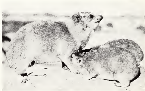
Fig. 1. two infants (about 3 months old) of P. johnstoni suckling from the pectoral teats. The fur in front of the dam's hind legs is disordered where the infants suck from the inguinal teats

Teat constancy is known in pigs (NACHTSHEIM 1925; DONALD 1937; HÖPLER 1943; BURGHARDT 1957; MCBRIDE 1963), cats (EWER 1960; ROSENBLATT 1972) and rats (BONATH 1972), all altricial mammals. Hyraxes are precocial, bearing fully developed young after a gestation period of approximately 7½ month (ROCHE 1962; MENDELSSOHN 1965; SALE 1965 a, b). The Rock hyrax P. johnstoni and the Bush hyrax H. brucei were observed in the Serengeti National Park, Tanzania, for 30 month. Most animals were marked. Hyraxes are the most characteristic resident mammals of the rock outcrops (kopjes), living in family groups consisting of an adult ♂, several adult ♀♀ and juveniles of both sexes. ♀♀ within a group have synchronized birth (1—4 young observed) and are genetically related (HOECK, in prep.).