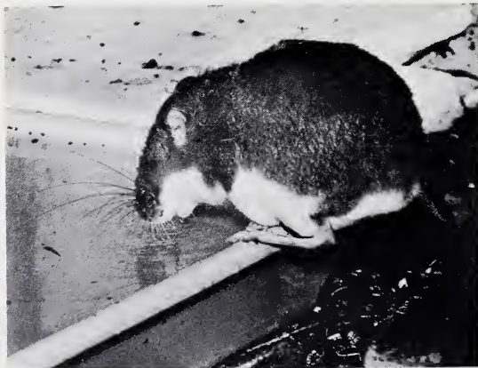
Fig. 2. Colomys goslingi , resting at the edge of the water. The vibrissae are dipped into the water

This male Colomys , which was only fed with dead shrimps and occasionally with live Oligochaeta during the first months in captivity, was offered 16 living tadpoles for the first time in May 1973. The tadpoles were put into the plastic basin, which contained water of about 2 cm deep. The next morning all the tadpoles had disappeared. A few days later approximately the same number of tadpoles (length: 15–20 mm) were offered in the basin. In a weak illumination it could be observed, that Colomys