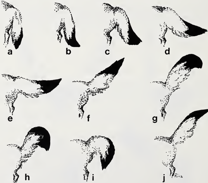
Fig. 3. Tail positions of the bat-eared fox: a-h = change in position related to increase in aggression or dominance; e = horizontal tail; h = inverted U tail; i = inverted tail during defaecation; j = pointed tail

An erect tail, with tip at an angle of 45°, (Fig. 3j) is very occasionally seen and seems to function as a "rallying" signal, when a group is foraging and especially playing, in long grass or shrubs. Straight horizontal tail positions are found only in contexts such as running, chasing other species (e.g. black-backed jackals Canis mesomelas ), flight or in