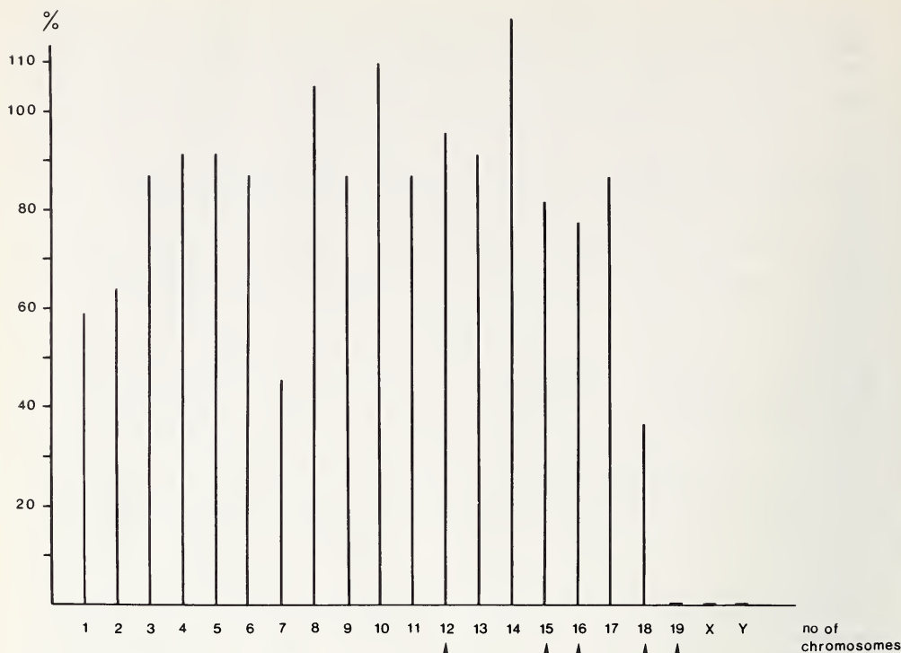
Fig. 3. Percentage of each chromosome of the standard karyotype as one part of individual Rb translocations in different populations of feral mice from Europe and Northern Africa. The calculation is based on data of 22 mouse populations (see Tab. 4 and Fig. 2). Values above 100 % result from multiple involvement of certain autosomes in Rb heterogeneous populations (see Tab. 4, populations 15, 16 and 19). NOR bearing chromosomes are marked with an arrow