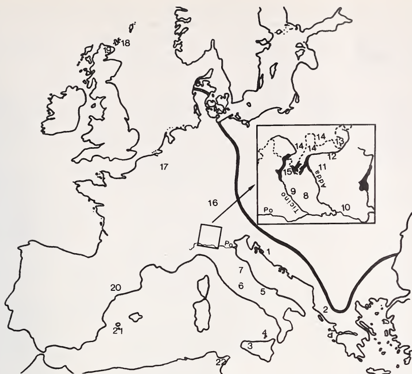
Fig. 2. Geographical sites of house mouse populations with Rb chromosomes in Western Europe and Northern Africa. Characteristics of each population are given in Tab. 4. Solid line represents borderline of the western and eastern subspecies of M. musculus (see: ORSINI et al. 1983)

standard karyotype of the longtailed house mouse, M. musculus , as well as of the Asiatic subspecies of the house mouse.