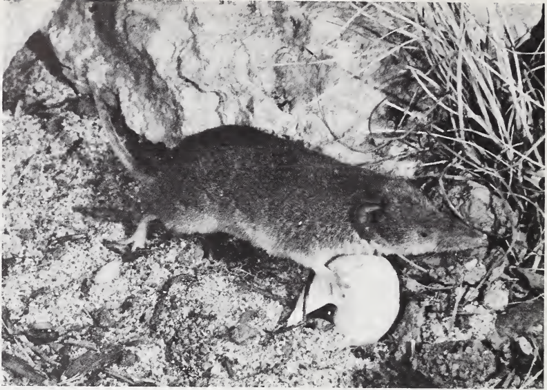
Fig. 1. Adult male Crocidura sicula from Gozo

line is not as sharp (Fig. 1). The chromosomal analysis revealed a karyotype of 2n = 36 (Fig. 2), which agrees with the one previously reported from Sicily (VOGEL 1988), and which differs from both C. russula and C. suaveolens .