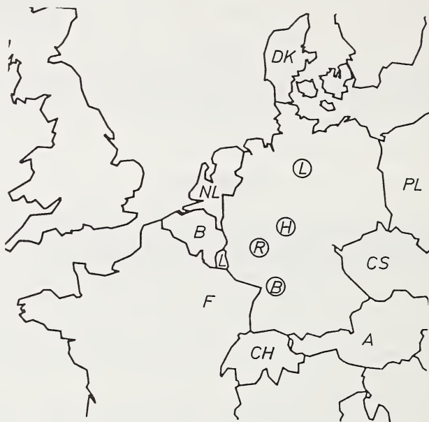
Fig. 1. Map of sampling sites: L = Lüneburger Heide, Niedersachsen, H = Hessen, R = Rheinland-Pfalz, B = Baden-Württemberg

Blood samples of 10 ml were taken from the Vena cava immediately post mortem into heparinized tubes and kept under refrigeration during transport. The processing of the samples, separation by horizontal isoelectric focussing in polyacrylamide gels and by electrophoresis in starch gels, as well as the staining procedure followed MUSHÖVEL (1986) and HERZOG (1988, 1991). Transferrin bands were identified by ^{59}\text{Fe} autoradiography.