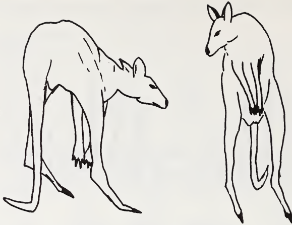
Fig. 2. Standing on tip-toes in broadside position during an agonistic encounter between two male agile wallabies

Ms was 'checked' by Mm; the younger male hissed and struck with his paws against the older before retreating.