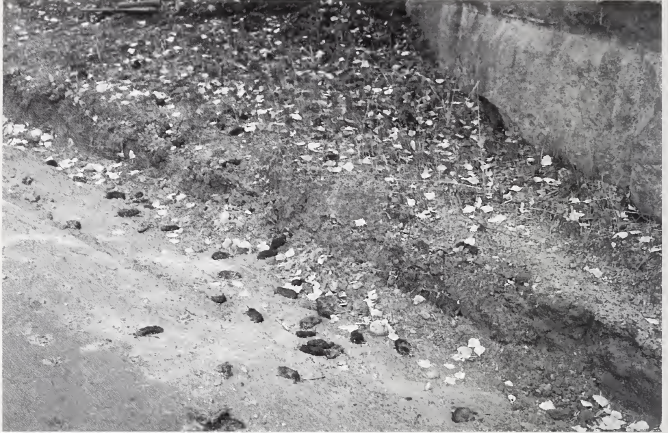
Fig. 1. Dead wood lemmings on the roadside under the railway bridge in Koivumäki in autumn 1982.

The railway bridges have proved to be the most effective "traps" (Fig. 1) because when migrating lemmings coming to the railway are forced to follow it. Not being able to go under or over the rails, they come to bridges and many of them fall down several meters and die. There are also several canals in Heinävesi (Fig. 2); when lemmings follow the shores, many of them fall into the canals and die. Traps have not been used except in 1982 (73 trap nights, see ESKELINEN et al. 1983) because numerous animals die anyway at the above-mentioned places.