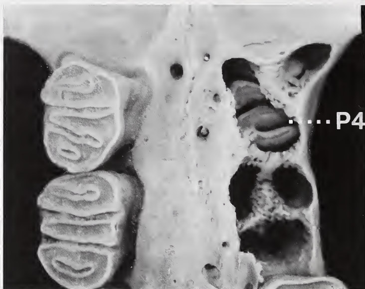
Fig. 1. Anterior portion of upper molar series of the specimen MN 11464 showing the left successional premolar (P4) after the removal of the deciduous tooth.

In order to investigate this question, the sample was divided into two separate groups, depending on whether the specimens seemed to be younger or older than the specimen displaying the erupting P4 (MN 11464). The features used for this relative age characterization were the wear of the molar teeth and the closure of cranial sutures (VOSS and ANGERMANN 1997). It could be assumed that all premolars in the group of younger specimens would be a dP4, while those in the group of older specimens would be a P4. Thus, any character that could be used to distinguish between a dP4 and a P4 should be consistently different in these two groups.