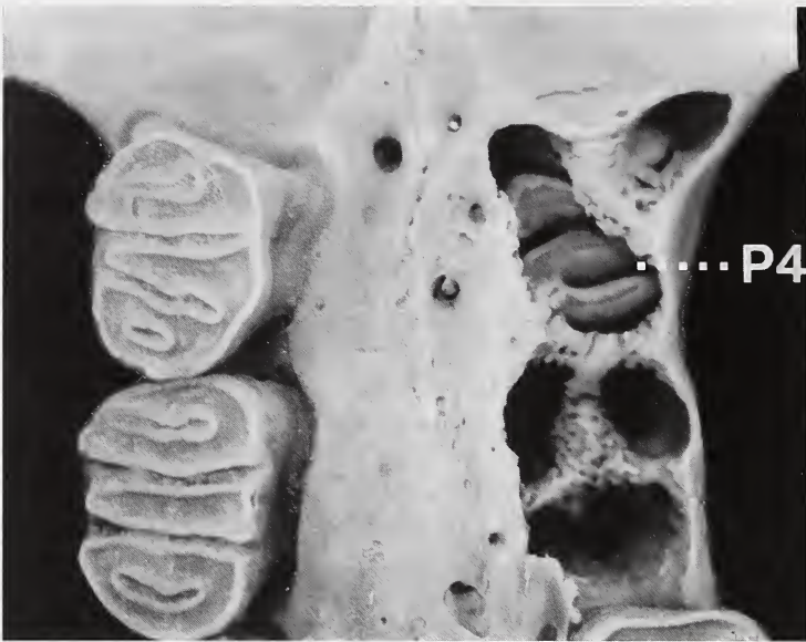
Fig. 1. Anterior portion of upper molar series of the specimen MN 11464 showing the left successional premolar (P4) after the removal of the deciduous tooth.

In order to investigate this question, the sample was divided into two separate groups, depending on whether the specimens seemed to be younger or older than the specimen displaying the erupting P4 (MN 11464). The features used for this relative age characterization were the wear of the molar teeth and the closure of cranial sutures (Voss and ANGERMANN 1997). It could be assumed that all premolars in the group of younger specimens would be a dP4, while those in the group of older specimens would be a P4. Thus, any character that could be used to distinguish between a dP4 and a P4 should be consistently different in these two groups.