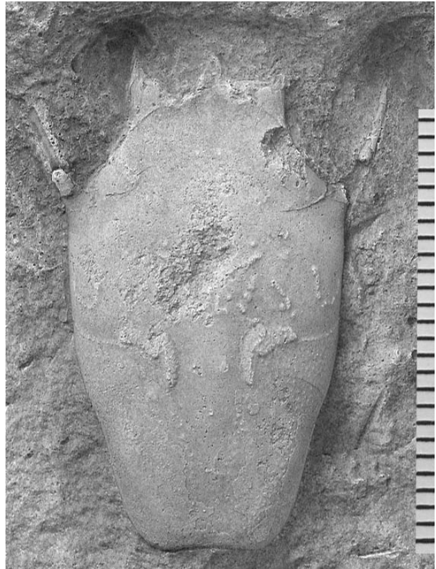
Figure 3. Macroacaena cf. M. franconica n. sp., cast of specimen figured by GRIPP (1969) and KÜMMEL (1972). From erratic Danian boulder at Travenbrück-Vinzler, northern Germany. Scale in millimeters.

According to its provenance from the Wellheim Formation of southern Bavaria, an early Turonian age is suggested for the raninid (MÖRS 1991). The early Turonian age is documented by the widespread occurrence of Inoceramus (Mytiloides) labiatus SCHLOTHEIM, a large benthic bivalve of age-diagnostic value.