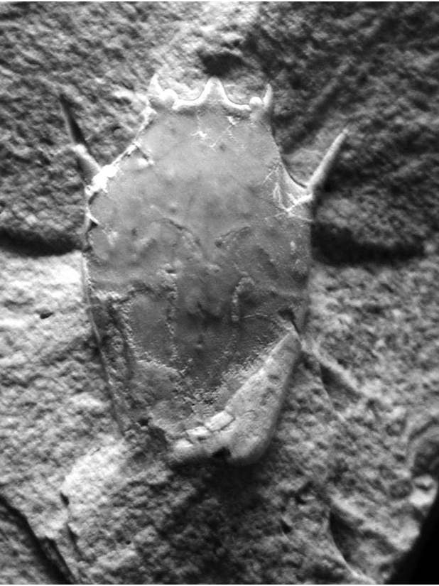
Figure 2. Macroacaena franconica n. sp., holotype. Lower Turonian, Mörsheim, southern Franconia, Germany; ex-situ find, coming from the so called “Wellheimer Inoceramen-Quarzit”, Jura-Museum Eichstätt, JME no. Tu 2003/3 (Coll. M. WULF, Rödelsee). Width of figure 31 mm.

WIENBERG-RASMUSSEN, 1992) exhibits somewhat shorter spines at the anterolateral corner and shows a furrow on the rostrum, whereas the fronto-orbital areas and the remainder of the carapace appear quite similar to species of Macroacaena .