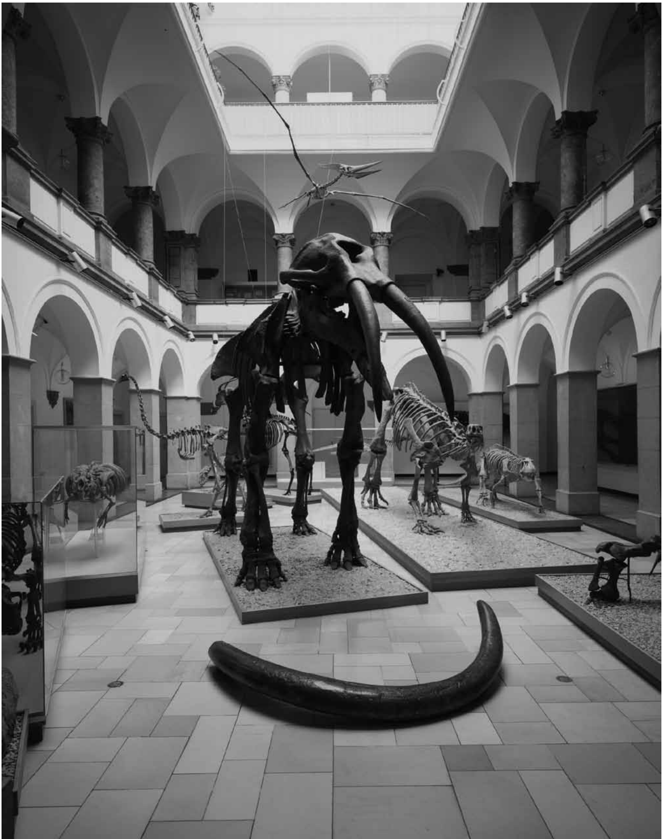
Atrium of the Paläontologisches Museum München with Gomphotherium aff. steinheimense as centerpiece