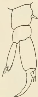
Fig. 27. Diaptomus novomexicanus . End of right male antenna.