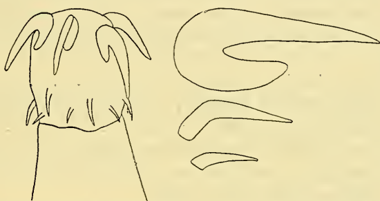
Figure 5. N. tenellus n. sp. Proboscis ( \times 145 ), hooks ( \times 465 ). Camera lucida drawing.

While the terminal hooks vary but little from those already described for N. emydis the size of the basal hooks is distinctly different.