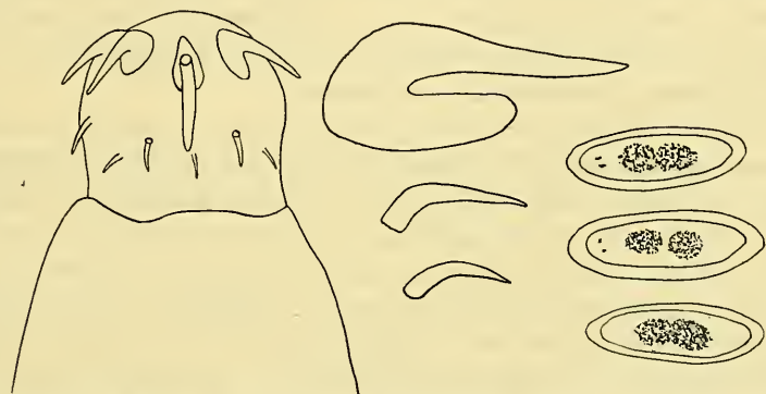
Figure 4. N. cylindratus n. sp. Proboscis ( \times 145 ), hooks ( \times 465 ), embryos ( \times 465 ). Camera lucida drawing.

Large Neorhynchi, bodies almost straight. Females 10–15 mm. long, maximum breadth a short distance caudad of proboscis, 0,7 mm. Males 4,5–8,5 mm. long, maximum breadth located as in females, 0,5–0,7 mm. Proboscis subglobular, slightly broader than long, length 0,149 mm., width 0,172 mm. Hooks in three circles, six hooks to a circle, those in adjoining rows alternating. Terminal hooks 0,079–0,097 mm. long, sharply recurved, strong, 0,014 mm. thick at base, root 0,058 mm. long, 0,029 mm. wide. Middle row 0,037 mm. long, 0,005 mm. thick at base. Basal row 0,021–0,025 mm. long, 0,003 mm. thick at base. Embryos 0,049–0,051 mm. long, 0,015–0,021 mm. broad. In intestine of Micropterus salmoides (Lacép.), Pelican Lake, Minnesota.