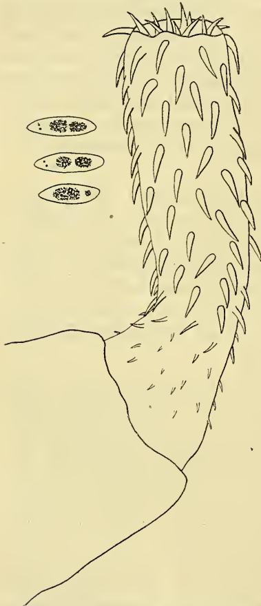
Figure 2. N. longirostris n. sp. Proboscis ( \times 145 ), embryos ( \times 465 ). Camera lucida drawing.

The rather robust body of this species is distinctly different from the body form described for N. gracilisentis . Instead of tapering gradually toward either end, thus becoming spindle shaped in form, the body of this species maintains a fairly uniform diameter until within a very short distance from the posterior end and then narrows down to a rounded termination. A similar condition holds for the anterior end of the body. The uniform diameter is retained up to a short distance back of the base of the proboscis and then a gradual decrease in diameter brings the body width down to that of the proboscis. In the gravid