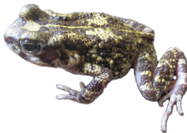
Figure 4. A specimen of the rediscovered Amietophrynus perreti from the type locality, the Idanre Hills, south-western Nigeria.

Amietophrynus perreti (Fig. 4) were observed during day and night, mainly on higher parts of the rocks. They were encountered on the hard rock surfaces and among low herbal vegetation on sandy soil between the rocks. During October 2013 we observed a total of 31 A. perreti , 16 during the day (12 person-hours search time, Table 1) and 15 during the night (6 p-h). In March 2014 we