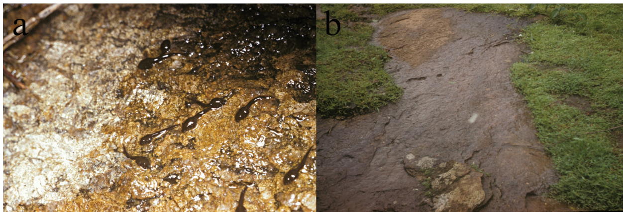
Figure 1. Habitat (right) of Amietophrynus perreti tadpoles (left) at the type locality, the Idanre Hills in Nigeria (photos: courtesy of A. Schlötter).

terrestrial tadpoles, developing in shallow water-films on wet, sometimes vertical rocks (Schlötter 1963; Fig. 1).