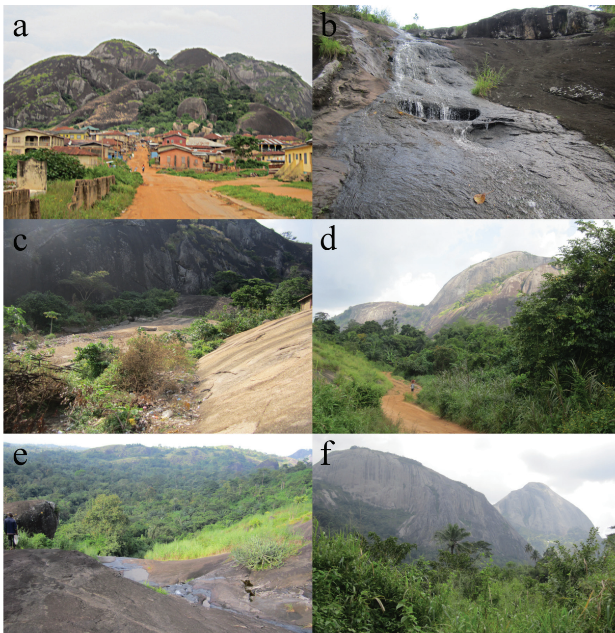
Figure 2. The Idanre Hills inselbergs in south-western Nigeria (a-f), the type locality and only known habitat of Amietophrynus perreti . Survey site A was only about 50 m from the last house in a; b: figures a overflow part of rock at site B; c: some A. perreti were observed close to the waste dumping site (left at the rock base), probably feeding on flies or other insects; d: a road leading to Site C, the cocoa farm being further in the background adjacent to the large rock; e: part of site C.