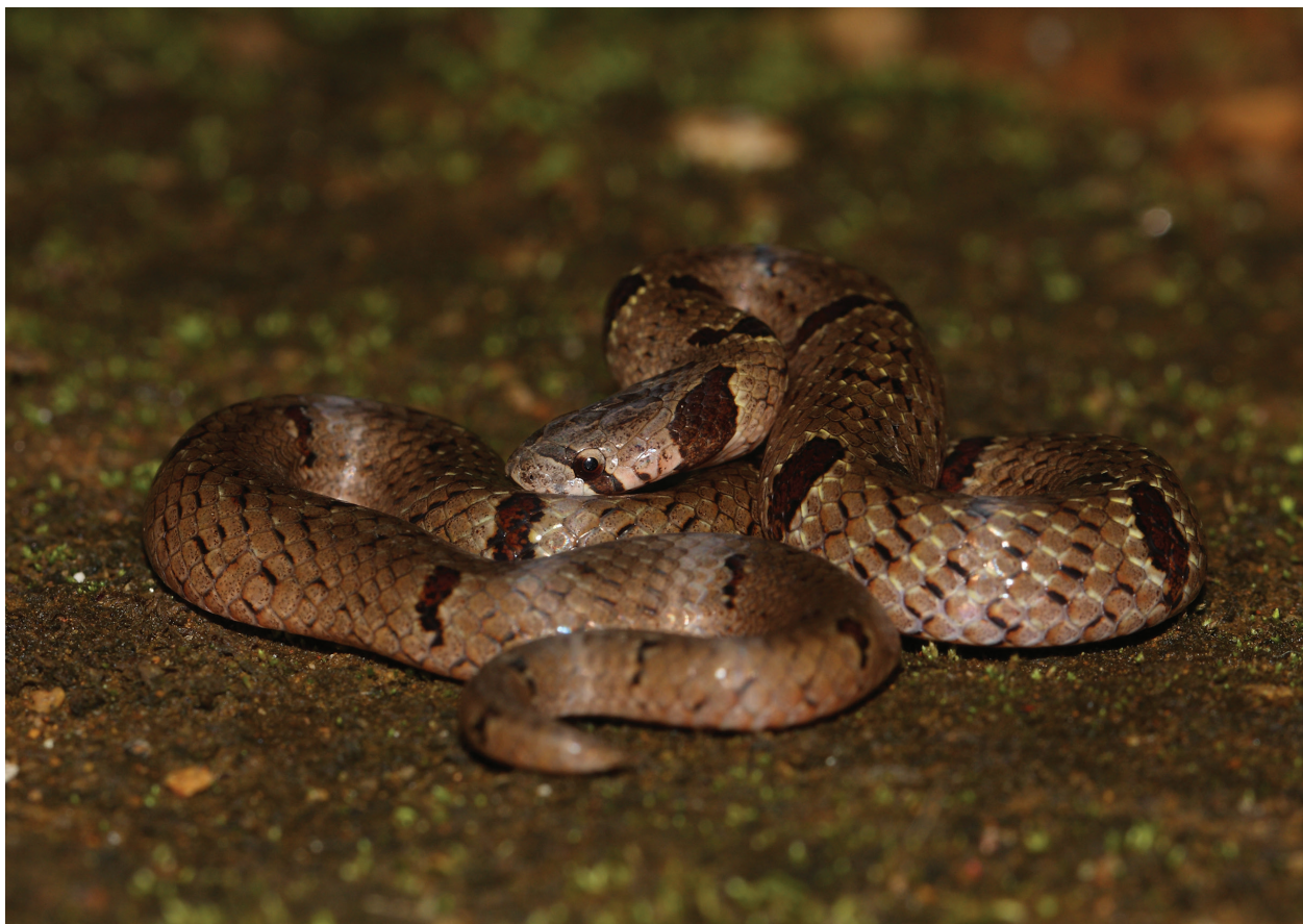
Figure 1. A live male of Oligodon sublineatus (not collected) at Sinharaja Forest Reserve, Sri Lanka.