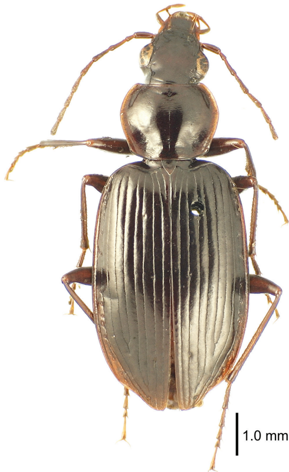
Figure 5. Notagonum kanak female (MNHN), label data: Ncalédonie / ile d. Pins / f. Faustien // MUSEUM PARIS / Ex. Coll. M. MAINDRON / Coll. G. BABAULT 1930 // Colpodes / kanak / Fauvel dedit 1906 (card mounted, abdomen removed, female genitalia and reproductive tract in vial on pin).

crosculpture; 5, margins of prosternal process rounded on posterior face; 6, short elytral sutural tooth present, subapical tooth absent; 7, metatarsomere 4 with shallow apicomедial ventral invagination and short lateral lobes, the outer, or lateral lobe, less than twice the length of the inner lobe.