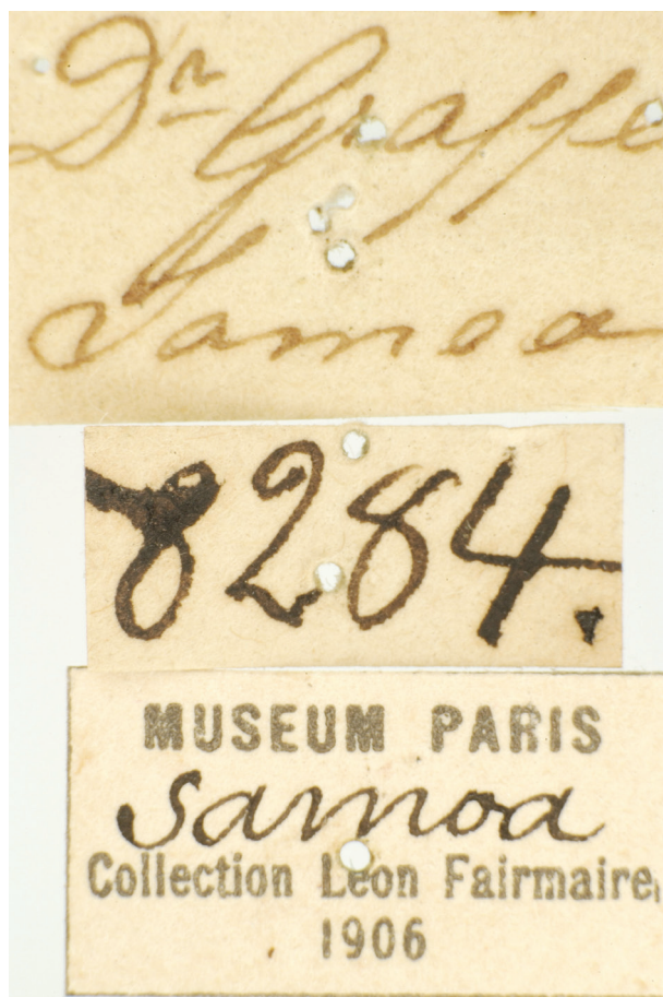
Figure 2. Specimen labels associated with holotype specimen of Bryanites graeffii .

brunneous, glabrous longitudinal ridge on each anterior and posterior surface; frontal grooves very shallow, ending posteriorly anterad the anterior supraorbital seta; posterior supraorbital setal position behind posterior margin of eye and 3\times as far from eye margin as anterior seta; frons and clypeus not demarked by suture, surfaces convex, continuous, only three very shallow transverse wrinkles medially at position of frontoclypeal suture; labral anterior margin straight, only slightly incurved medially; mentum tooth broad, apex flattened medially, mentum setae positioned posterad curved mentum margin each side of midline; submentum with two setae each side. Pronotum broad, maximal width 1.08\times median length; lateral margins only slightly incurved anterad rounded hind angles; broadly longitudinal laterobasal depressions joined by well-defined transverse depression anterad basal convexity; median longitudinal impression very finely incised, absent on basal convexity, continuous to beaded front margin; front angles projected anteriorly, their apex tightly rounded; lateral marginal depression of equal breadth from midlength to front angles, about twice as broad in basal half of pronotum; proepisternum smooth, proepimeron very narrow. Elytra flattened overall, sutural intervals upraised at suture in apical half of length; elytral apex evenly rounded; elytral