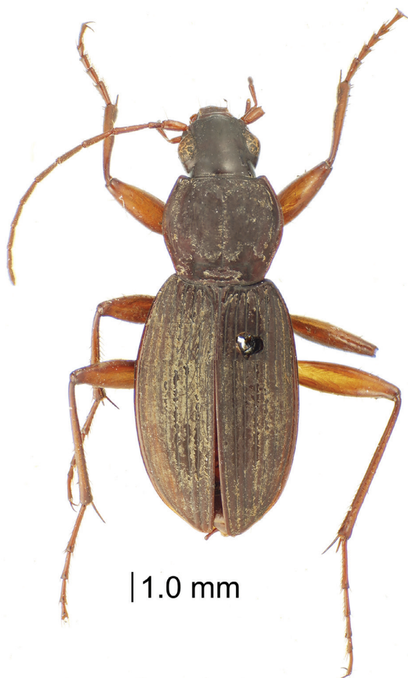
Figure 1. Male holotype, Bryanites graeffii , dorsal view.

brunneous, glabrous longitudinal ridge on each anterior and posterior surface; frontal grooves very shallow, ending posteriorly anterad the anterior supraorbital seta; posterior supraorbital setal position behind posterior margin of eye and 3\times as far from eye margin as anterior seta; frons and clypeus not demarked by suture, surfaces convex, continuous, only three very shallow transverse wrinkles medially at position of frontoclypeal suture; labral anterior margin straight, only slightly incurved medially; mentum tooth broad, apex flattened medially, mentum setae positioned posterad curved mentum margin each side of midline; submentum with two setae each side. Pronotum broad, maximal width 1.08\times median length; lateral margins only slightly incurved anterad rounded hind angles; broadly longitudinal laterobasal depressions joined by well-defined transverse depression anterad basal convexity; median longitudinal impression very finely incised, absent on basal convexity, continuous to beaded front margin; front angles projected anteriorly, their apex tightly rounded; lateral marginal depression of equal breadth from midlength to front angles, about twice as broad in basal half of pronotum; proepisternum smooth, proepimeron very narrow. Elytra flattened overall, sutural intervals upraised at suture in apical half of length; elytral apex evenly rounded; elytral