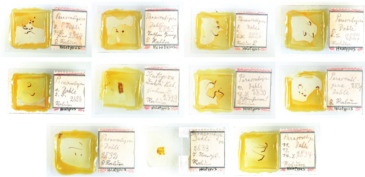
Figure 2. Examples of microscope slides from the Karl Verhoeff collection bearing dissected parts of the anatomy. ZMB 3840a–k, the complete type series of slides belonging to Parascutiger dahli Verhoeff, 1904 collected by Friederich Dahli from Ralum in Papua New Guinea; Verhoeff slide numbers 2824–2834. Type material in the slide collection is marked with red lines on the labels and usually complements alcohol material.