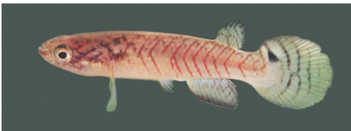
Figure 7. Melanorivulus linearis sp. n., paratype, UFRJ 11679, 23.4 mm SL.