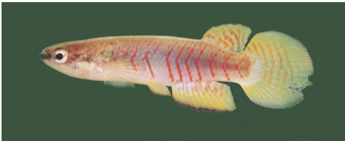
Figure 6. Melanorivulus linearis sp. n., holotype, UFRJ 11678, male, 25.1 mm SL.