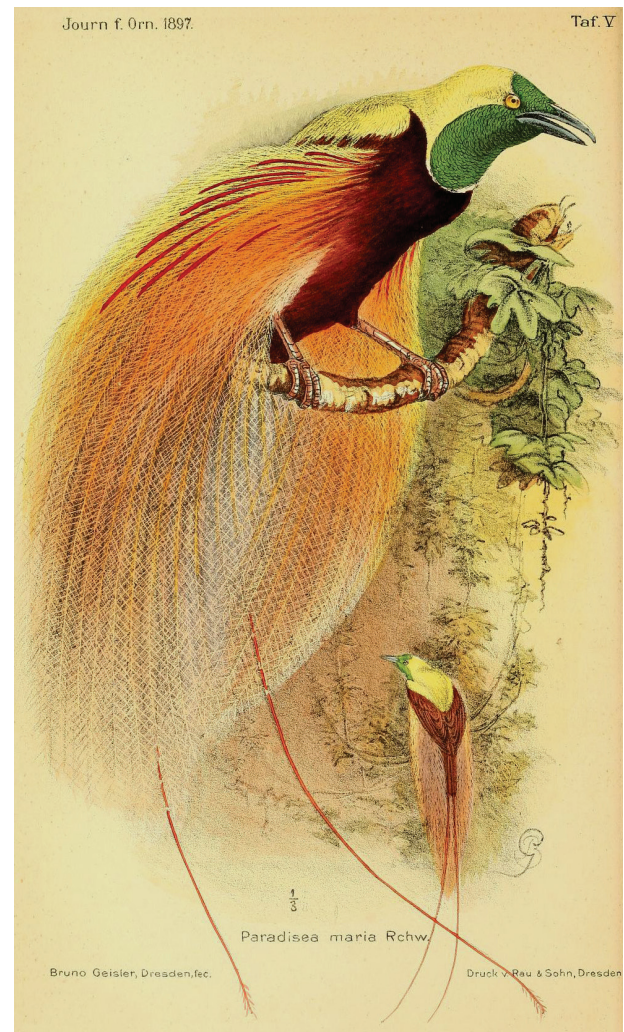
Figure 1. Plate of the male hybrid bird of paradise Paradisaea maria from Reichenow (1897).

Hybridisation between different bird species is a relatively common phenomenon. So far about 4,000 combinations of hybrid origin have been identified, about half of which are crossbreedings in captivity (Mc Charty 2006). According to this author, however, the total number of hybridisations in birds is estimated to be much higher, since hybrid specimens are usually difficult to identify.