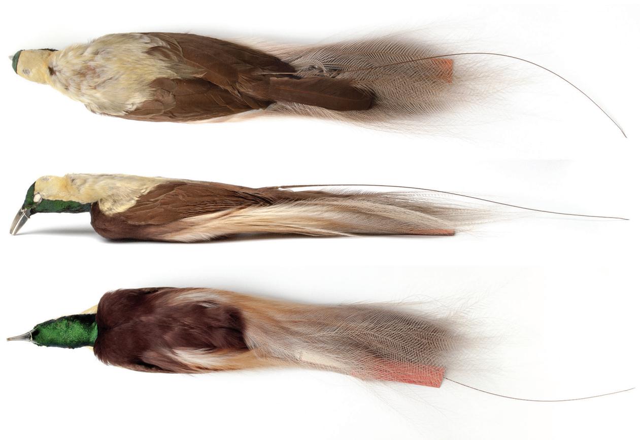
Figure 3. The holotype (ZMB 31049) of Paradisaea maria Reichenow, 1894, in dorsal, lateral, and ventral view.