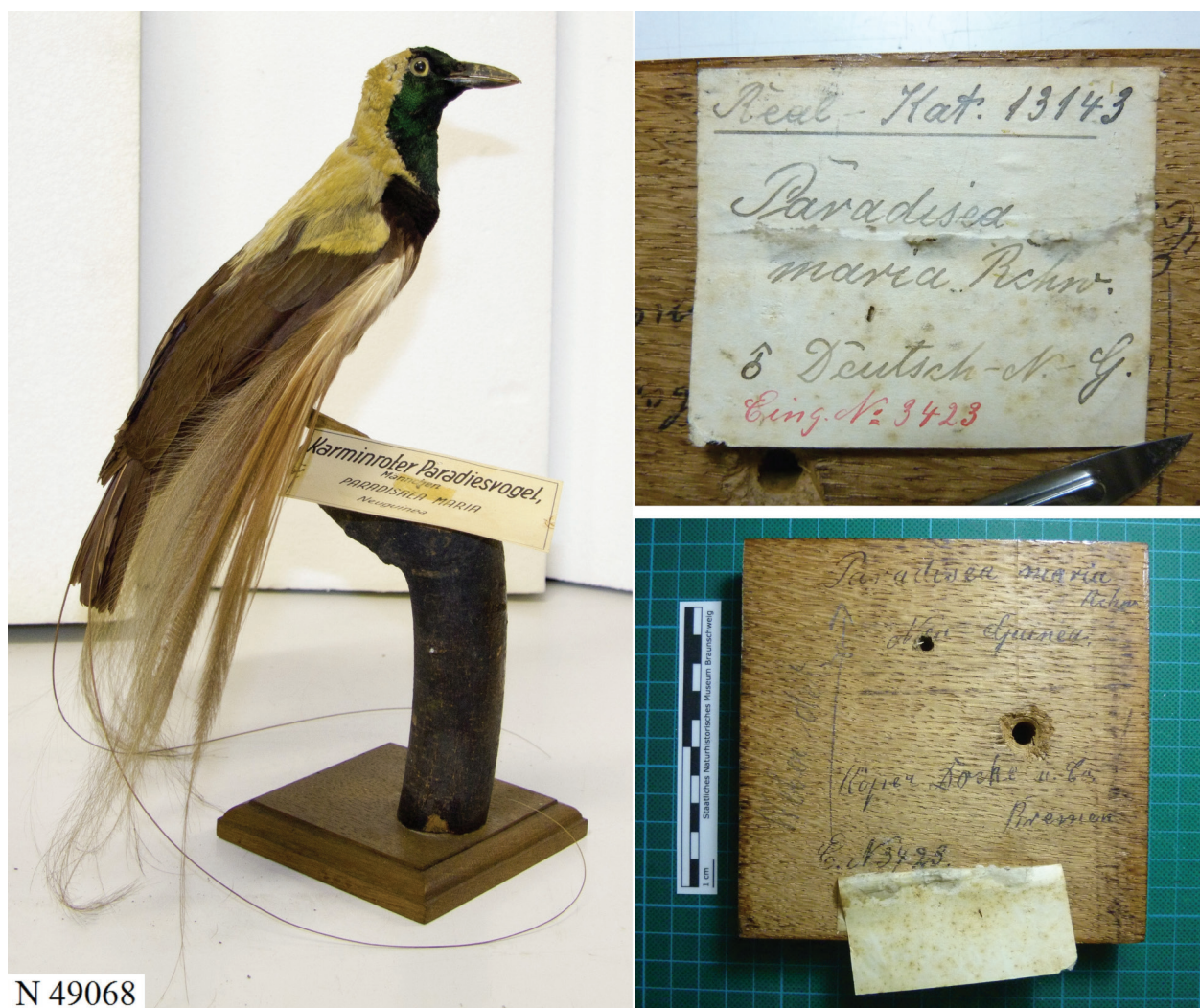
Figure 4. The male specimen SNMB N49068 of P. maria in the Staatliches Naturhistorisches Museum in Braunschweig. The information written on the underside of the pedestal in black ink is as follows: “ Paradisea maria R[ei]ch[eno]w. Neu-Guinea [= New Guinea] Körper Locke u. Co. Bremen C. N. 3423. Weber [?] det. [?]”. The white label written with pencil, which partly sticks above the former ink writing, reads as follows: “Real. Kat. 13143 Paradisea maria Richw. ♂ Deutsch-N.-G. Eing. N° 3423” (= Realia Catalogue No. 13143, Paradisea maria Reichenow, ♂, German New Guinea, Entrance No. 3423).

line with the species name. This additional label reads as follows: “Real. Kat. 13143 Paradisea maria Richw. ♂ Deutsch-N.-G. Eing. No. 3423” (= Realia Catalogue No. 13143, Paradisea maria Reichenow, ♂, German New Guinea, Entrance No. 3423) (Fig. 4).