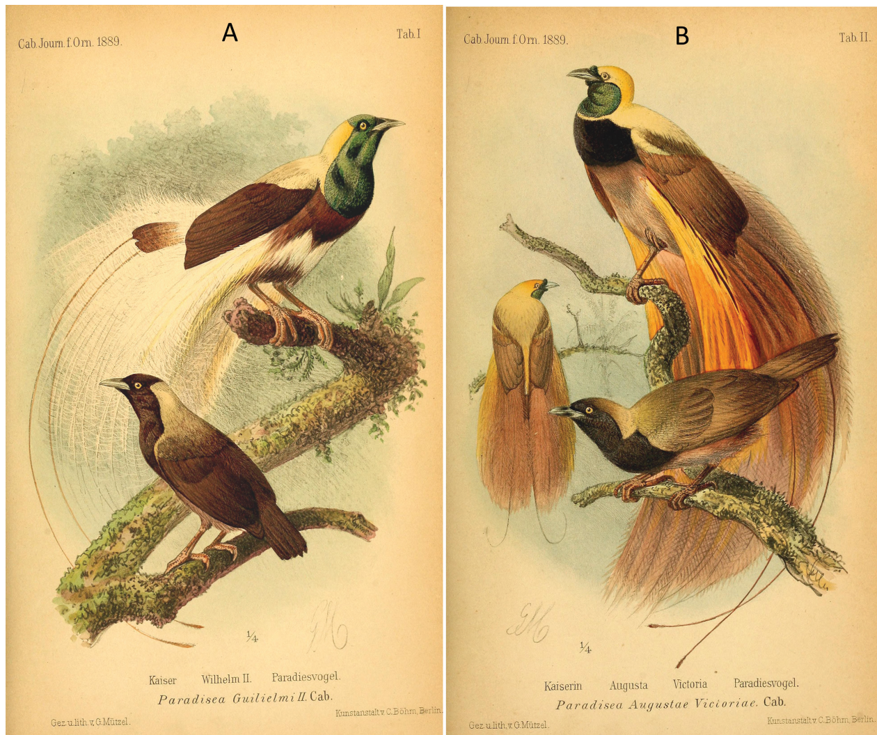
Figure 2. Plates of Paradisaea guilielmi (A) and P. raggiana augustaevictoriae (B), the presumed parental species of P. maria , related to the original descriptions by Cabanis (1888). Reproduced from the Biodiversity heritage library ( http://biodiversitylibrary.com/ ).

the species he himself had previously described (see also Rothschild 1898). Subsequently, Rothschild (1910) and Stresemann (1923: 40) suggested, that also P. maria is a hybrid form between P. guilielmi und P. (raggiana) augustaevictoriae . The latter discussed a second specimen from the Berlin museum (ZMB 951) that was allegedly collected by Dr Bürgers during the German Empress Augusta (now Sepik) River Expedition in 1912–1913. Subsequently, however, Stresemann (1925) corrected that the original label of this voucher specimen had been mixed up and that it was actually collected by H. Andechser, a planter from Singana, at the southern slopes of the Herzoggebirge (the Herzog mountains) south of Lae at the base of the Huon Peninsula. Later, Stresemann (1930a) even mentioned five specimens of Maria's bird of paradise, which he had examined in the ornithological collections in Berlin (the holotype ZMB 31049, Fig. 3) and Tring (UK), respectively. In the early 1930s, the four specimens from Walter Rothschild's (1868–1937) famous bird collection at Tring were sold to the American Museum of Natural History in New York (LeCroy 2014).