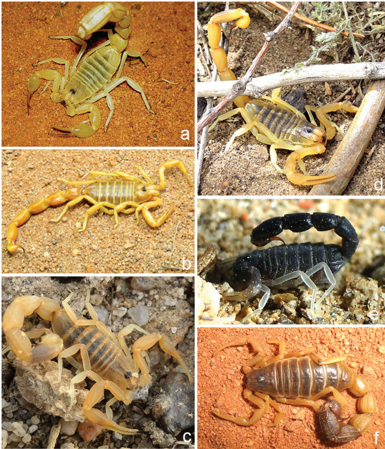
Figure 2. Habitus photographs of several Sudanese scorpion species, all in the family Buthidae, for which we can offer new distribution data here. a. Androctonus amoreuxi (Audouin, 1826); b. Buthacus leptochelys (Ehrenberg, 1829); c. Compsobuthus wernerii (Birula, 1908); d. Leiurus quinquestriatus (Ehrenberg, 1829); e. Orthochirus olivaceus (Karsch, 1881); f. Parabuthus abyssinicus (Pocock, 1901). Of these, A. amoreuxi , L. quinquestriatus and P. abyssinicus have a potent venom and are regarded as medically significant.