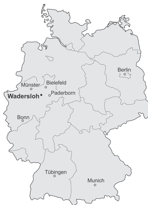
Figure 2: Map of Germany with labeled locality Wadersloh (Westphalia).

Measured data (Tabs 2-10) are following sections described and/or depicted in Heissig (1972b) and Borsuk-Białynicka (1973). Comparative data are given for an extant Indian rhino ( Rhinoceros unicornis Linnaeus, 1758) specimen (ZFMK 1988.16) and three Miocene (MN5, 16 Ma) rhinoceros species from the Bavarian locality Sandelzhausen 60 km north of Munich (Germany). The extant Rhinoceros unicornis specimen is housed at the Zoologisches Forschungsmuseum Alexander Koenig (ZFMK) in Bonn, Germany. The Sandelzhausen rhino specimens are belonging to three taxa: Prosantorhinus germanicus (Wang, 1928), Plesiaceratherium fahlbuschi (Heissig, 1972), and Lartetotherium sansaniense (Lartet, 1851). The isolated material is belonging to different individuals and is housed at the Bayerische Staatssammlung für Paläontologie und Geologie (BSPG) in Munich, Germany. The collection numbers of the Sandelzhausen fossils have the prefix BSPG 1959 II.