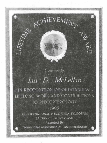
Example of 1995 Achievement Award