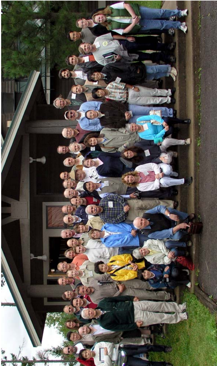
CONFERENCE AND SYMPOSIUM PARTICIPANTS