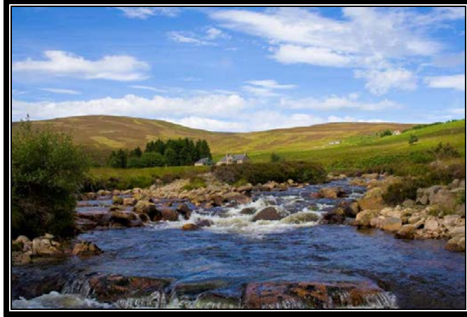
Glen Tanar – location for the post-conference trip.