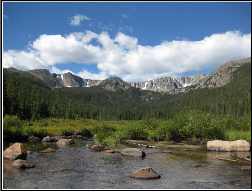
South Fork of the Poudre River, a pristine Rocky Mountain stream flowing through the campus area.