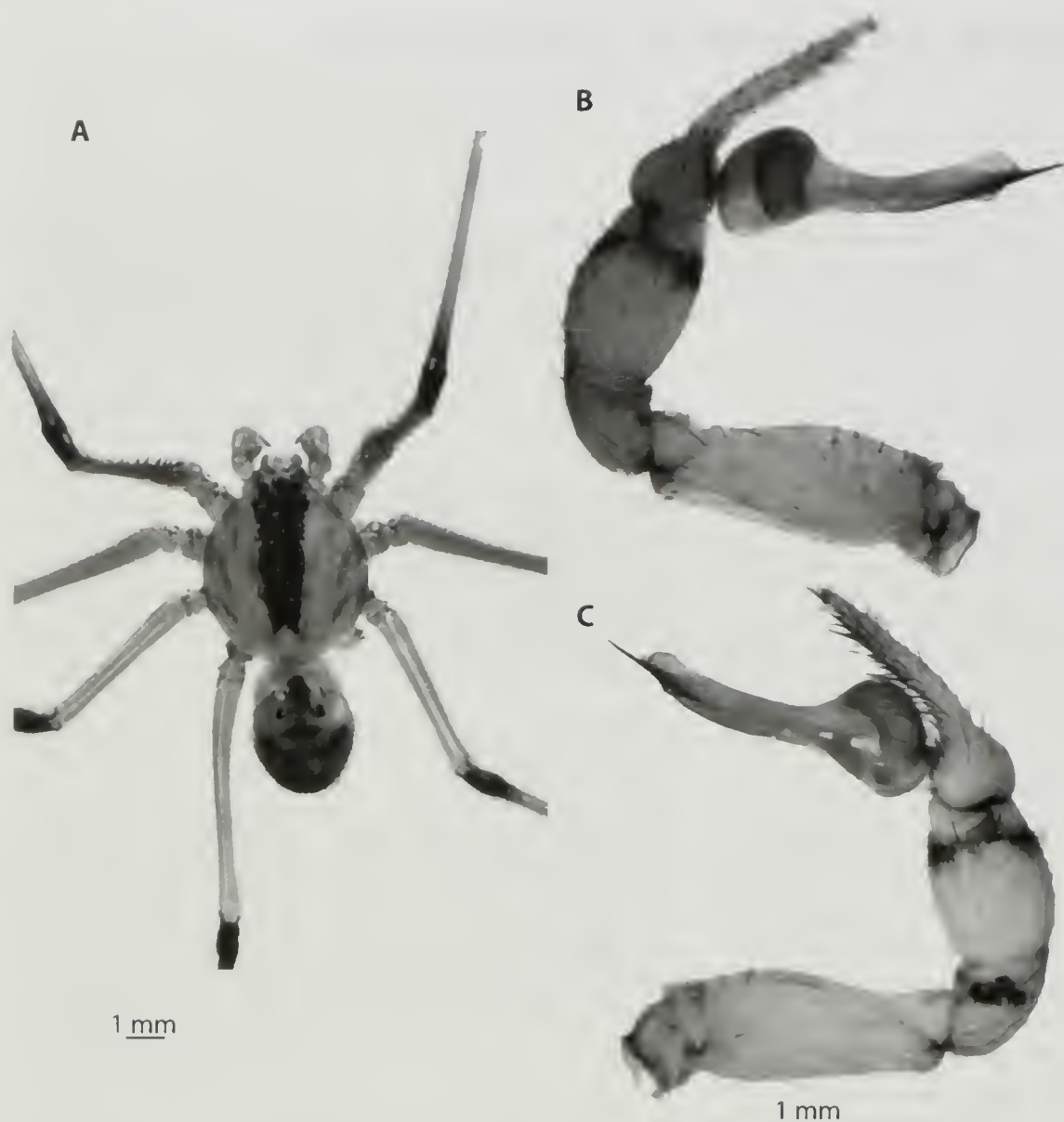
Fig. 1: Scytodes arwa . A: habitus of male; B: male right palp, prolateral view; C: male right palp, retrolateral view